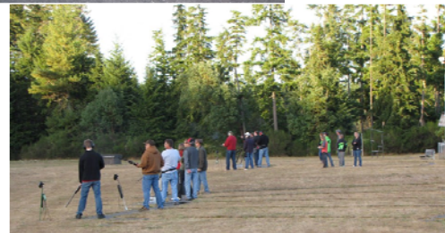
Friends and family of WWA members enjoying some shooting .