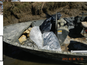
A portion of the gatherings.