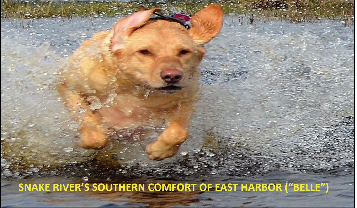
SNAKE RIVER'S SOUTHERN COMFORT OF EAST HARBOR ("BELLE")

SEND US YOUR "ACTON DOG" PHOTO AND WWA WILL PUBLISH IT ON THIS PAGE