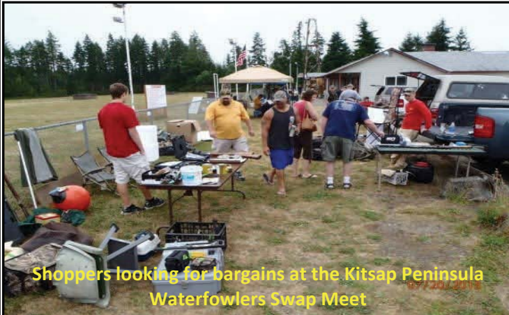
Shoppers looking for bargains at the Kitsap Peninsula Waterfowlers Swap Meet