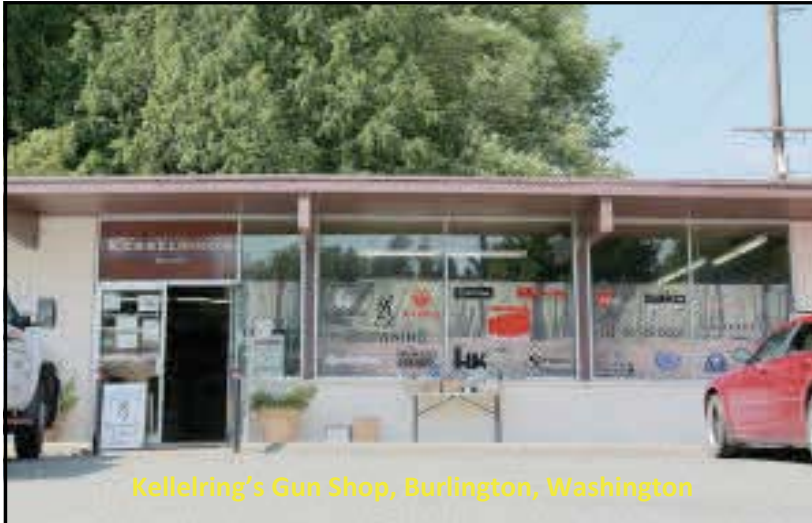
Kesselring's Gun Shop, Burlington, Washington