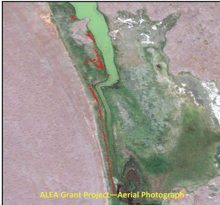
ALEA Grant Project—Aerial Photograph

Here is an update on the ALEA Grant project and includes a work party scheduled for later this year: