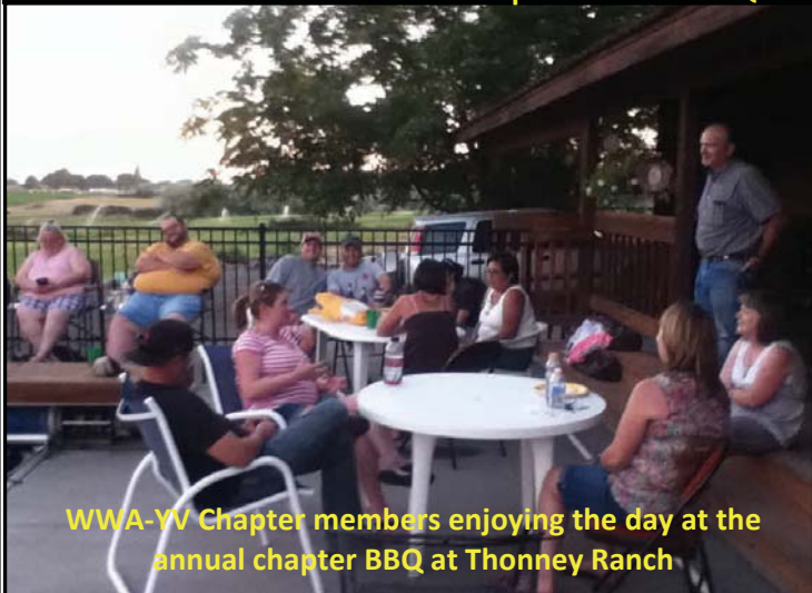
WWA-YV Chapter members enjoying the day at the annual chapter BBQ at Thoney Ranch