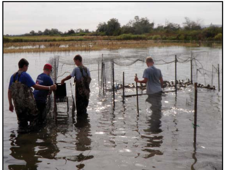
Four unidentified young boys (not WWA members) herding ducks into one of the net pens.