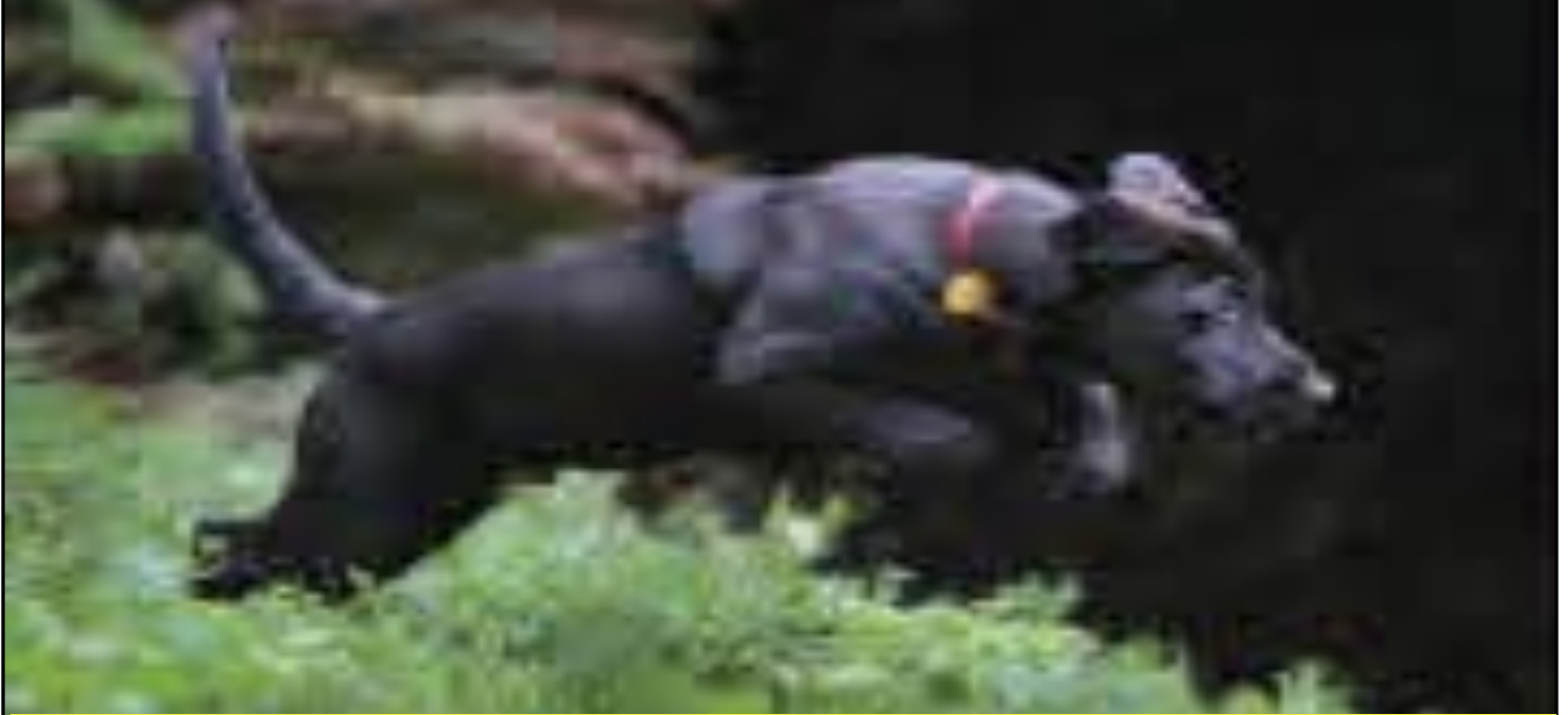
“COOPER” - UNDERHILL FAMILY, TUMWATER, WASHINGTON

SEND US YOUR DOG'S PHOTO TO WWA BULLETIN@COMCAST.NET, SEE IT PUBLISHED HERE