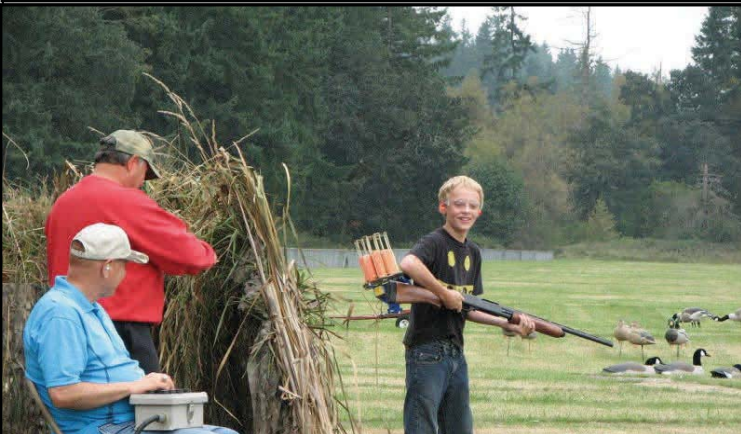
Two unidentified young boys enjoying the Grays Harbor WWA Chapter's 2013 youth shoot.