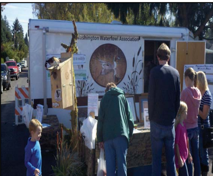
Photo of the the Lower Columbia WWA Chapter's booth at the 2013 "Birdfest."