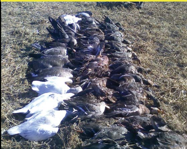
Successful results of part of a 2013 Alberta waterfowl hunt