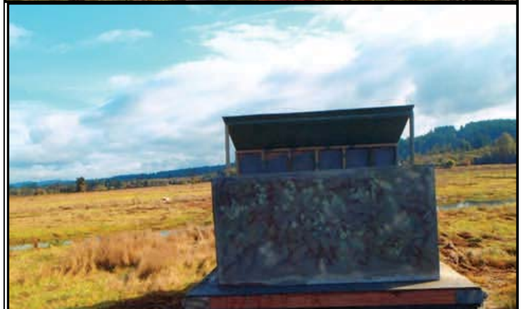
WDFW Biologist, Jeff Skriletz (T) and one of the Kitsap WWA Chapter's Lynch Cove blind restoration projects (B).