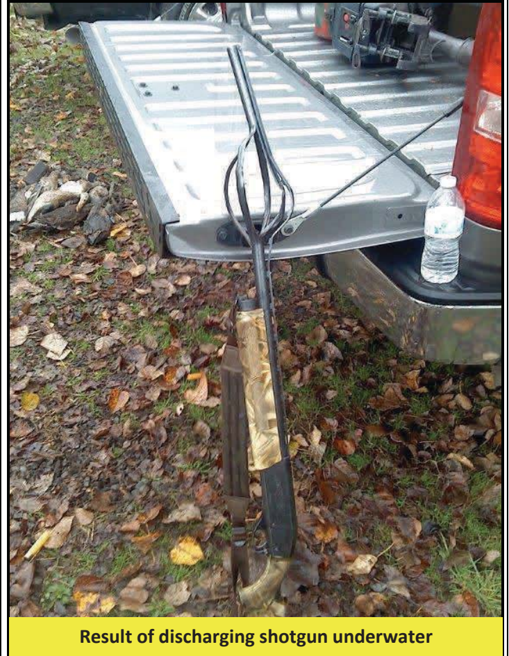
Result of discharging shotgun underwater

boat and keep my gun in hand things got worse. I still had ahold of the gun with finger in the trigger hole not thinking to try and change my grip as I struggled for control of the situation. So.... the gun goes off underwater! A little unnerving to say the least! I finally get the gun up and realized the barrel was toast.