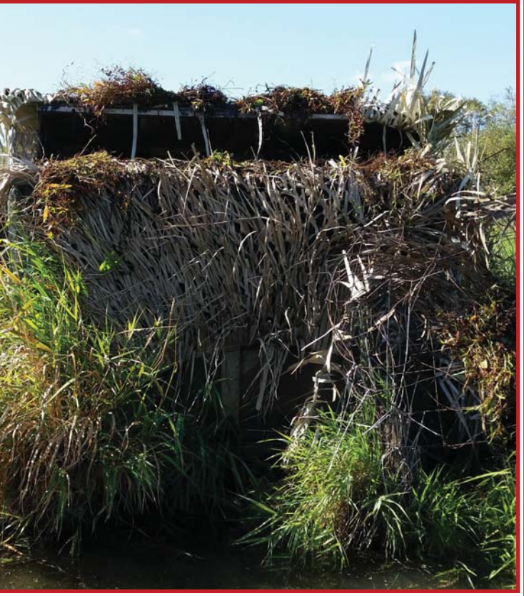
Blind #13 Before and After: Rick Scott repairs some of the screen used to hold the camo material at Blind #13 at the Ridgefield National Wildlife Refuge (NWR). The finished product in the photo at the right. The Insert photo on top is Blind #9 at Ridgefield NWR after a camo spruce up performed by WWA-LC Chapter members. Who knows what blind is in the background over Rick's right shoulder?