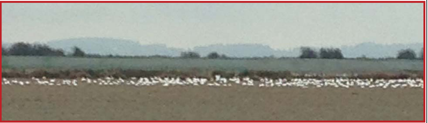
For all of you white goose hunters it has started snowing here in the valley with about 5K more landing every day.