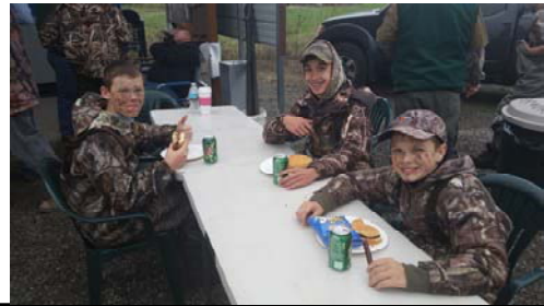
Young hunters await blind assignments for the youth hunt and enjoy burgers.