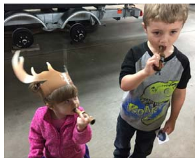
Kids blowing duck calls at CW Sportsman's Show