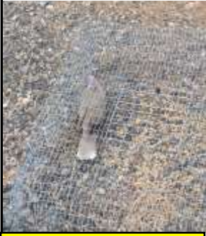
A trapped dove ready for banding.

WWA-YV Chapter members are taking on dove banding this year. Area biologists are going for smaller-scale dove banding operations this summer, but in an increased number of locations. The hope is that the net numbers will remain the same, but the increase in locations will help to spread out the work. We will report in later in the summer how our efforts have gone.