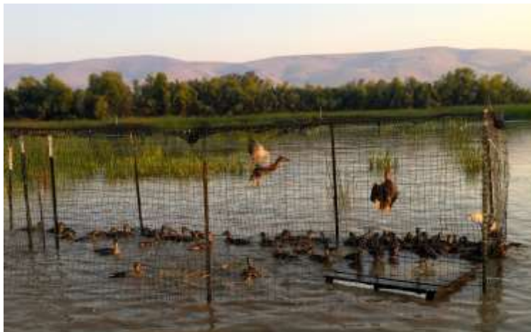
Trap full of ducks in the Lower Valley.

Our yearly push on duck banding in the Lower Valley will begin in the next few weeks. YV Chapter members will again be making a major contribution toward getting a significant number of ducks banded. We are hoping for full duck traps very soon!