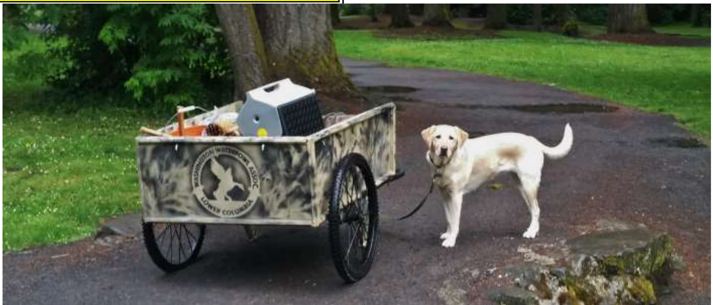
A doggone good time had by all!