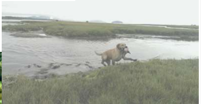
Retriever Training at the Swinomish Gun Club on Padilla Bay in Skagit County.