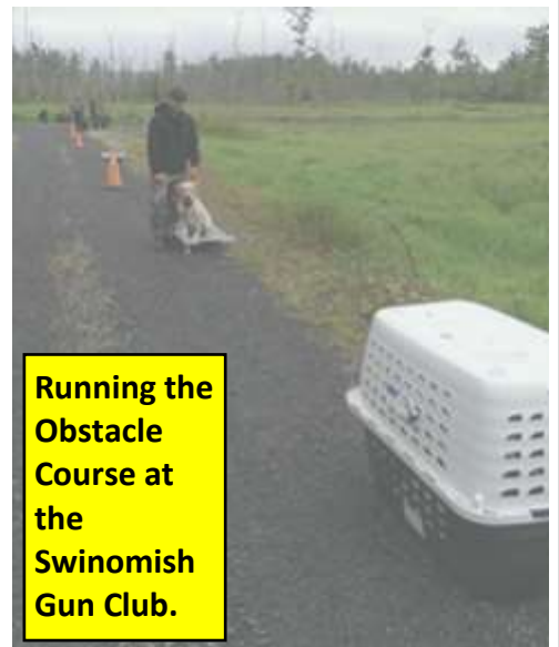
Running the Obstacle Course at the Swinomish Gun Club.