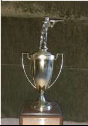
The Ferd Nist Trophy

Competition in the annual Ferd Nist Trophy Shoot begins in July. Named after one of the original founders of WWA [then the Washington Duck Hunters, Inc. ] in 1945, the shoot over several months and different disciplines is set up to determine the best shotgunner in WWA . The rules on page 18 are set up to allow WWA members of all Chapters to participate. Just get your local Range Master and another WWA member to verify your score in each event. Let's get some more Chapters involved this year!