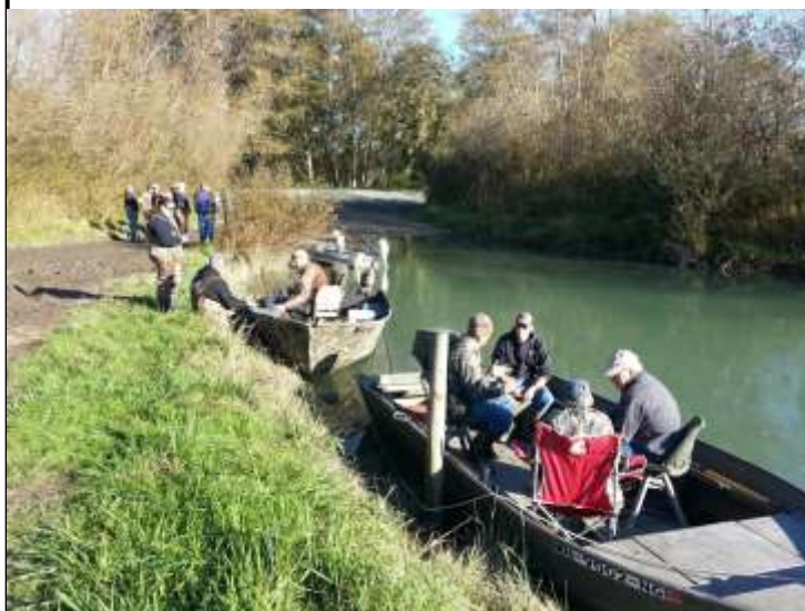
Members climbing aboard for their tour of the Farmed Islands and Skagit River in 2015. Be sure and join them this year for insider tips and hints!

This is a never ending search for water fowlers. You can always hear someone else blasting away the day and you just don't know how to get there. Well on Saturday, October 1 st we are going to be doing a boat tour of the South Fork of the Skagit River and the Farmed Islands . We will meet at the HQ Boat Launch at 10am, to head out. Should be good for about 4 hours but you can come and go as needed.