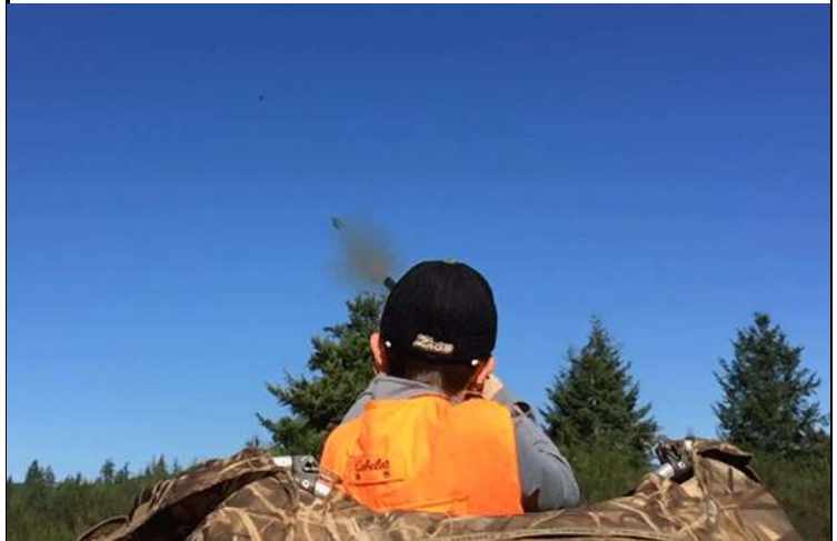
One of our Youth Shoot attendees shooting a target from a layout blind- He hit the target by the way (above). All of the kids and volunteers at the September 10 Youth Shooting Event (below).

Finally I hope everyone has a great and safe waterfowl season and I hope to see some of you "out there" this year!