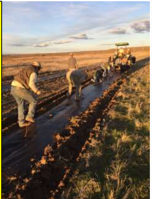
Moses Lake Chapter WWA members working on the ALEA Planting Project in November 2016. Some 9,000 trees & shrubs were planted along the Middle Crab Creek channel.

Watch for more on this in future bulletins.