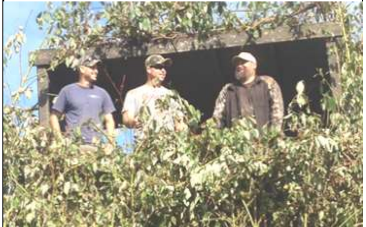
Refurbishing an ADA blind at Debay Slough along with tree clearing and blind building.

build opening up a new timber area too. The fun part of this was that we were able to bring along the crew from Waterfowl Evolution . ( https://www.youtube.com/user/waterfowlevolution ) The crowning moment of the whole work party was my truck getting stuck in the timber and the crew having to pull me out! It was a great turnout with lots accomplished despite the bad driving on my part!