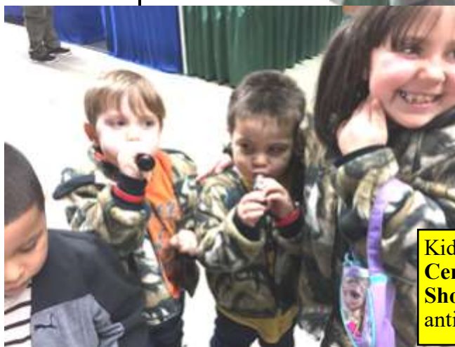
Kids blowing calls at the Central WA Sports Show – we used lots of antibacterial gel here!