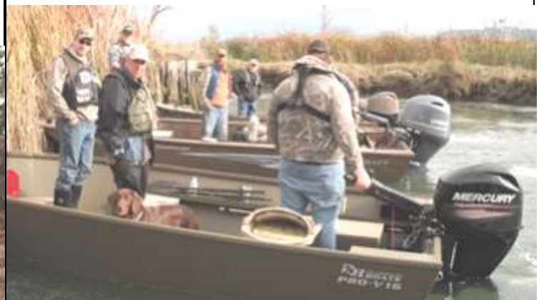
Pre-season tours of the many hunting grounds available to WWA members.

Work parties and tours are a big part of what we have been doing here in the Northwest. With clean-ups after the season at the local Wildlife area's to preseason tours of some of the off beaten locations. One of my favorites is the HQ/Farmed Island tours that we have done the past few years. Everyone loading up in the boats and taking them out to show them some of the off-beaten places to hunt.