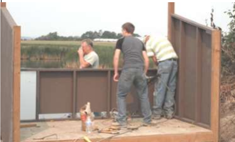
Building the ADA/Bird viewing blind at Skagit Wildlife Area.