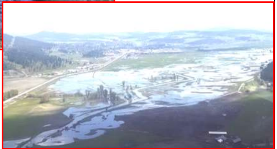
Upper left: Douglas County Potholes Upper right: Grant County Potholes Lower right: Pasture flooding near Colville