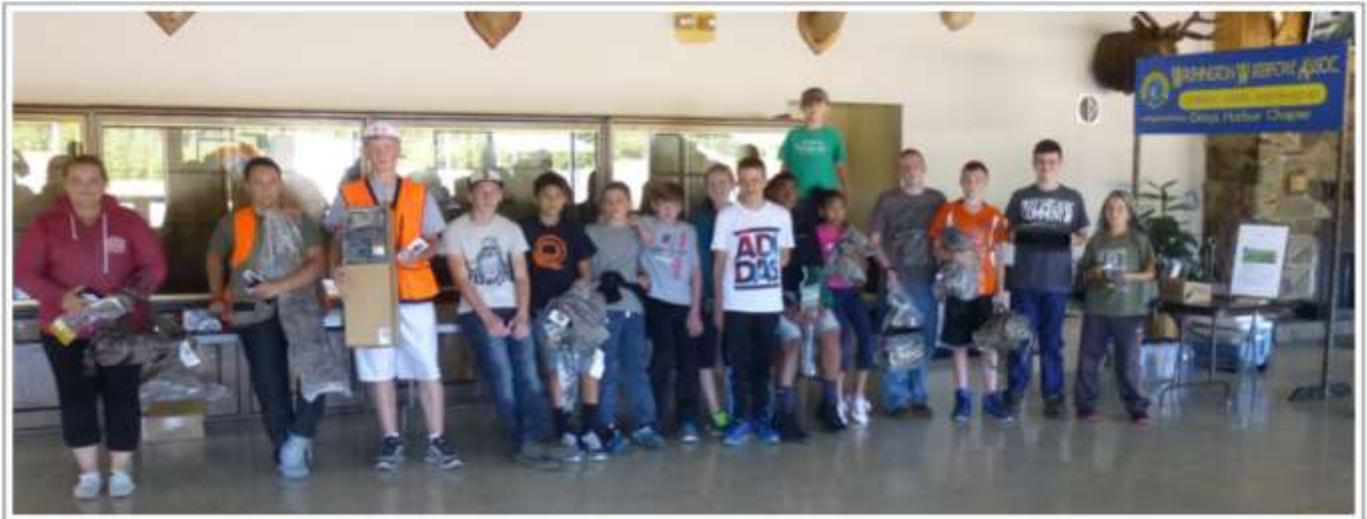
WWA Waterfowl Workshop and Youth Shoot. The kids get an opportunity to learn and get involved.

How were you introduced to hunting? Many people that hunt may not think much about how they were introduced to the activity of hunting even though it has become such a significant part of their lives. They may even take that introduction for granted. In reality, many people that hunt most likely started hunting because someone in their family created the opportunity, provided the necessary equipment, and taught them how to hunt; it was just part of the hunting family's routine of passing on the hunting heritage.