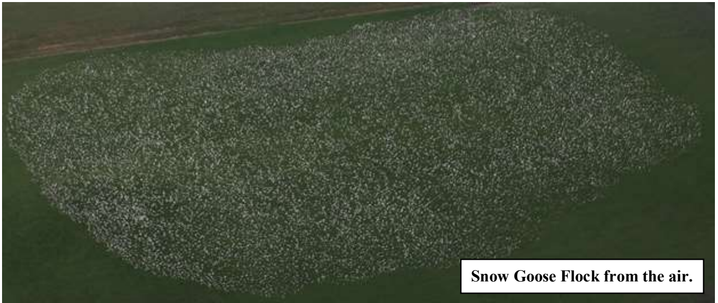
Snow Goose Flock from the air.

Our snow geese flights are a joint effort with the Canadian Wildlife Service as the population spans the border with birds regularly moving back and forth between the Fraser Delta in B.C. and the north Puget Sound estuaries. We flew on December 21 st and the Canadians flew on January 20 th . The two surveys came amazingly close with both sets of photos revealing about 85,000 birds. A flock in Whatcom County managed to give us the slip on both flights but was counted from the ground and numbered about 2,000 individuals. These numbers were down a little from last year but are still robust enough to justify increased bag limits.