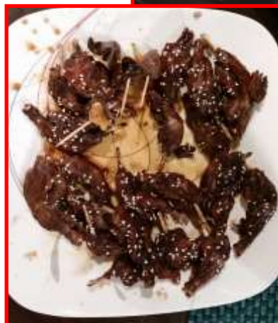
A sampling of the meal: Sesame Teriyaki duck legs and cheese infused duck hearts