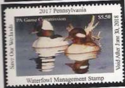
For "Most Favorite," this year's contest featured a three-way tie between Ohio (top right), Arkansas and Pennsylvania.

To get to the point, the "Best Design" category featured a two-way tie between Ohio (one of last year's winners) and Washington State, each with three votes. Arkansas was close behind with two. Both entries are shown nearby. What's interesting (again) this year is that these are two very different stamps; the Ohio stamp is part of an overall AIM pane design and format (it isn't offered separately), and the Washington State stamp is a single design that features a dog very prominently.