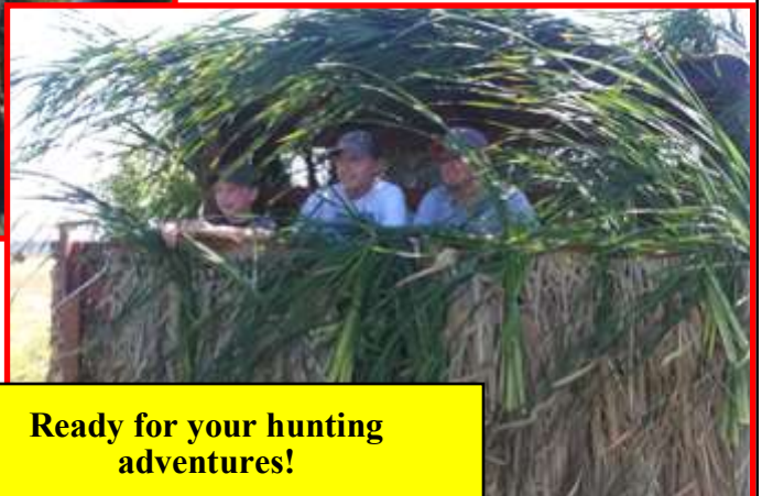
Ready for your hunting adventures!