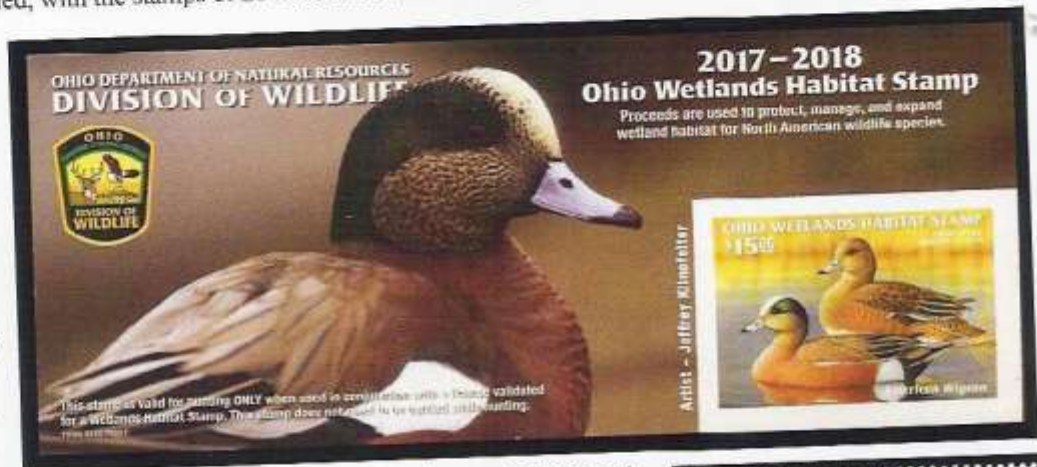
Ohio and Washington State share top honors in this year's poll for the "Best Design" category.

Each year we feature the NDSCS poll to get membership feedback on the products of the state duck programs. It should be stated – up front – that there is no way this can be an apples-to-apples comparison for judging. Not only are the formats and requirements different from state to state, but artists' handling can be very different, as you are no doubt well aware. While we do feature a "Best Design" category, it (like the others) is simply a subjective opinion and not fine art critique. Still, we'd like to think that the results of our polls help artists and state programs shape future stamps.