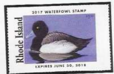
Rhode Island's stamp ended up "winning" the "Least Favorite" category.