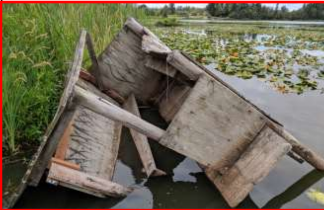
This blind appeared salvageable if we could get it upright and replace the front.