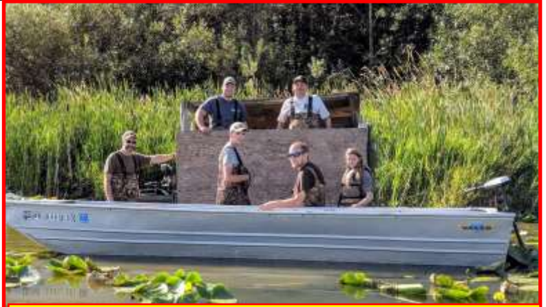
The first group admiring their handiwork before boating to the pit blind to help the other group.

Thank you to everyone that made it out for the work party last Saturday at Lake Terrell . We made two (2) more blinds functional and cleaned out a few more in less than four (4) hours. The weather was perfect and we had a ton of fun. The next meeting will be held Tuesday, September 4 at 7 pm in the Ferndale Public Library . Feel free to email me agenda requests.