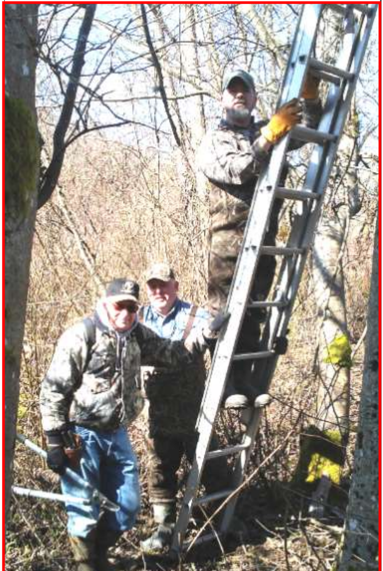
Southwest Chapter Members performing annual Wood Duck Box Maintenance. Thanks!