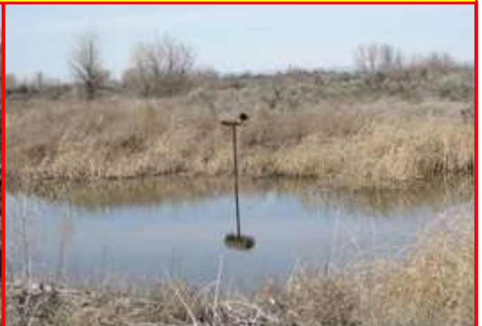
A maintained nest-tube, ready for a lucky hen.