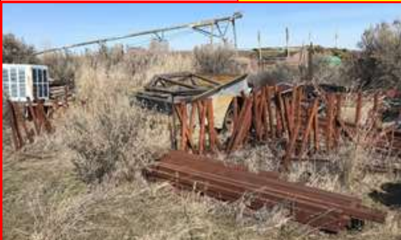
The mother-load of supplies was found!