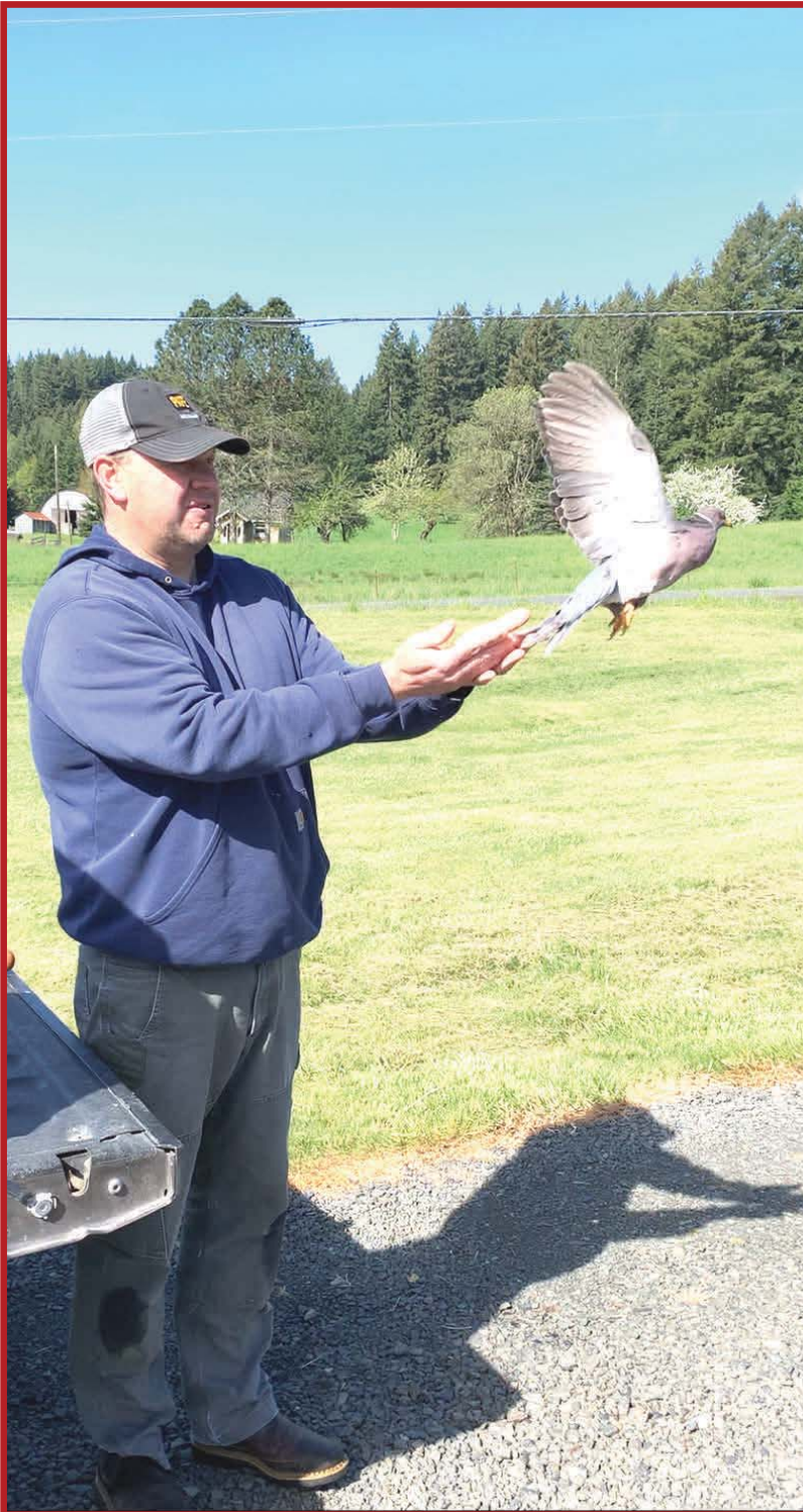
(Banding Band-Tails Continued)