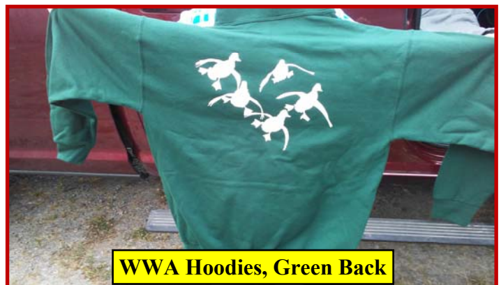
WWA Hoodies, Green Back