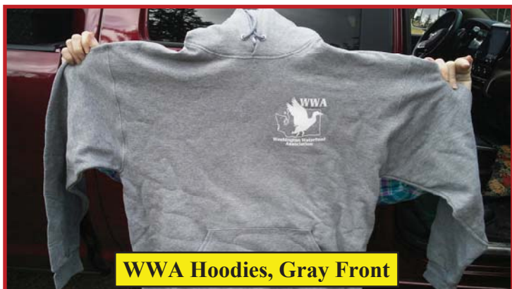
WWA Hoodies, Gray Front

16409 Canyon Rd. E. Puyallup, WA 98375 (253) 537-6151 www.tacomassportsmensclub.com