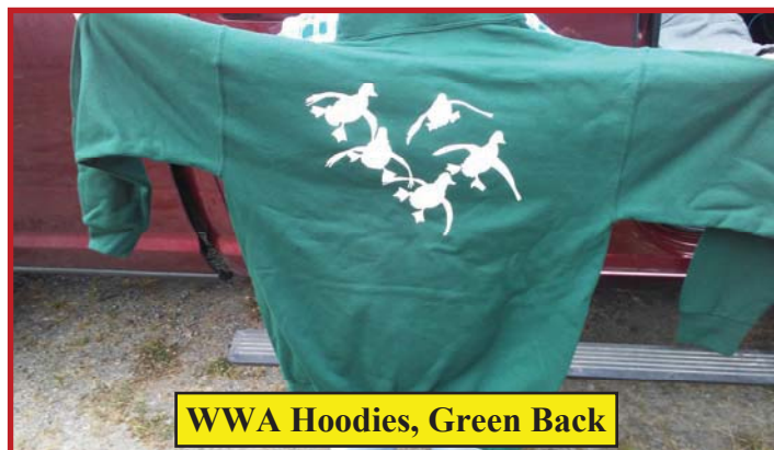
WWA Hoodies, Green Back