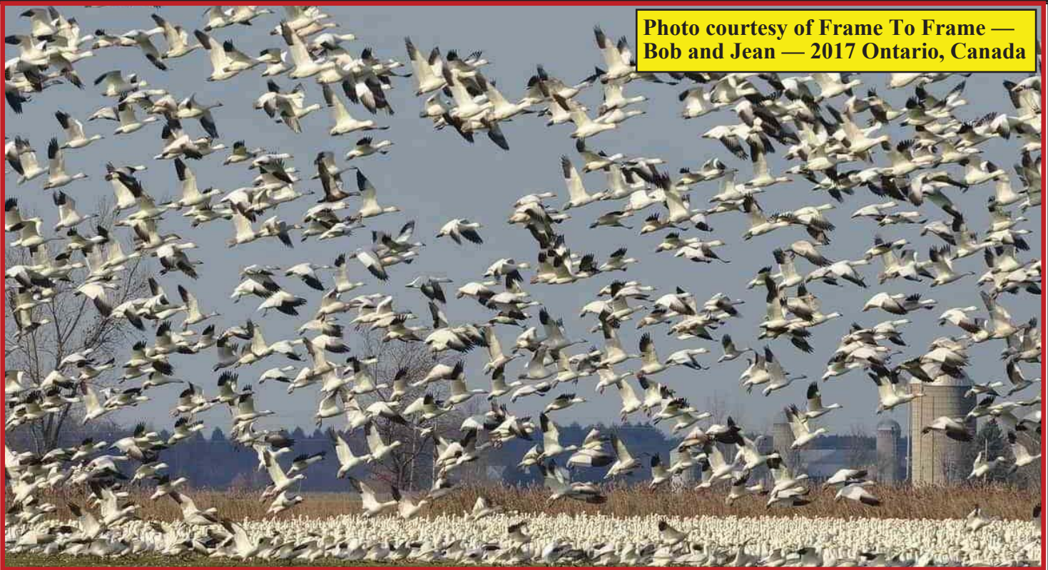
2017 Ontario, Canada