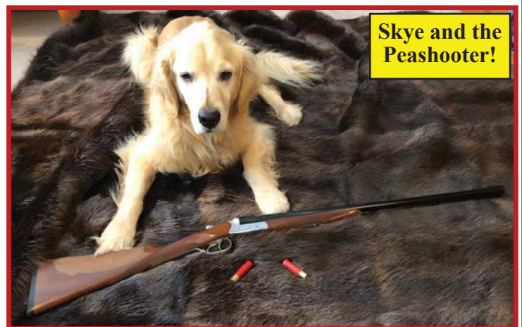
Skye and the Peashooter!

Of course #2, I forgot to take pictures of the truly amazing snows, so you'll have to imagine the sight with this stock photo.