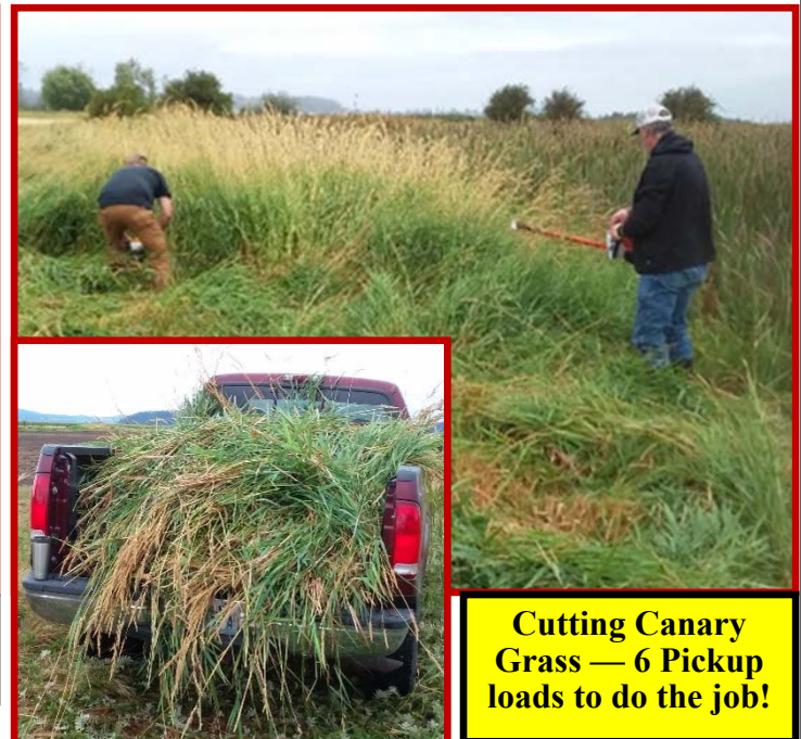
Cutting Canary Grass — 6 Pickup loads to do the job!