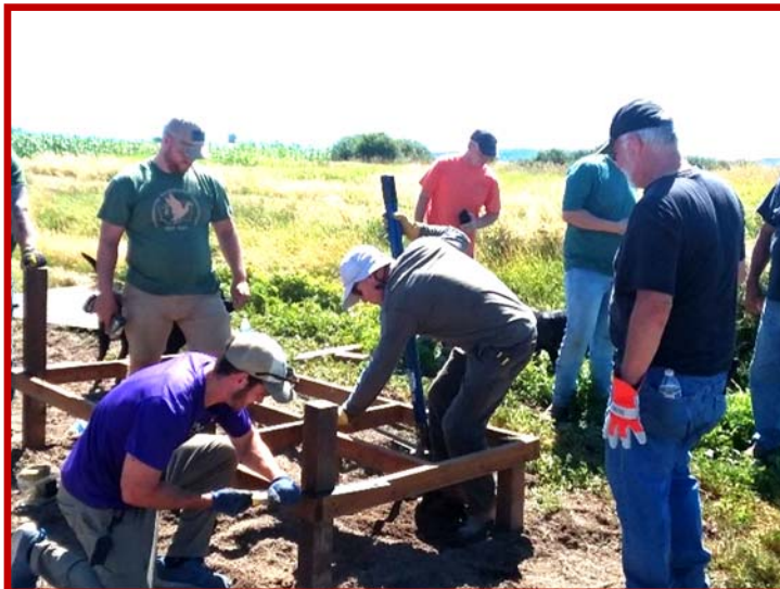
Building a solid foundation for the High Rise Blind.

The blinds all were constructed with treated 2 x 4 and plywood bases with a few raised on 4 x 4's in wetter areas. T-Post construction was used to secure welded metal fencing. We used hedge trimmers to cut 3 truck loads of canary Grass to camo out the blinds. Initial construction was completed on all five (5) blinds.