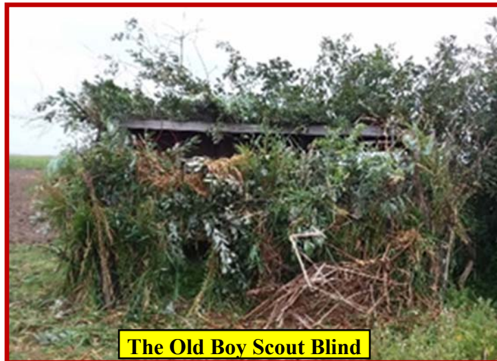
The Old Boy Scout Blind

Thank you to all of the volunteers who spent their Saturdays supporting public hunting. This is what volunteerism in the WWA is all about.