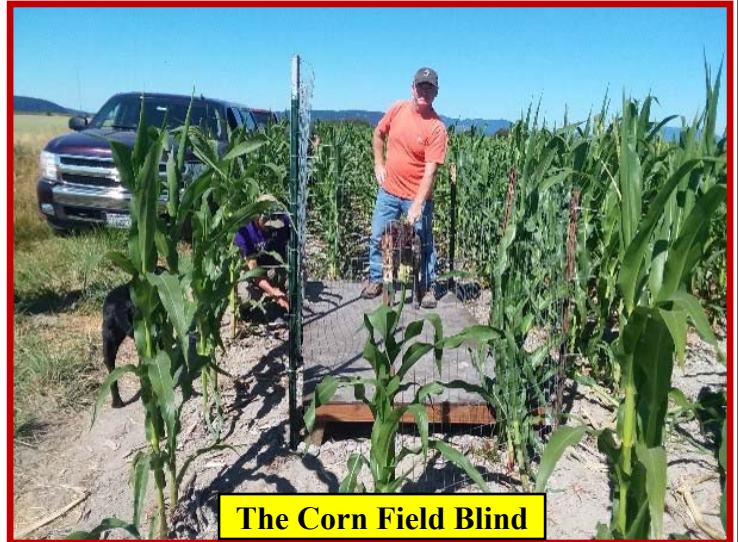
The Corn Field Blind