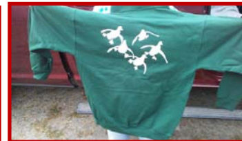
WWA Hoodies, Gray Front and Green Back

Still available along with some 2021 WA State Duck Calling Championship T-Shirts from the SW Chapter . See Page 1 for contact info for SW Chapter Chair Bruce Burns .