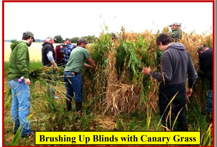
Brushing Up Blinds with Canary Grass

On to the existing blinds... We repaired benches, added T-posts to several blinds, installed welded metal fencing on a old Boy Scout built blind, and brushed it up for the season opener.