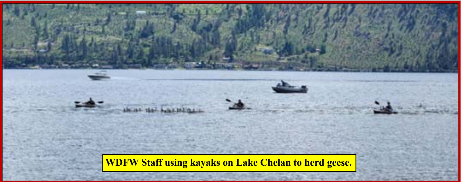
WDFW Staff using kayaks on Lake Chelan to herd geese.